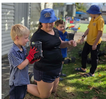
Whole School Gardening