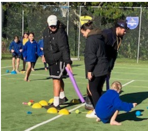
Kēmu sessions started this week for our Year 5, 6, 7 & 8 students