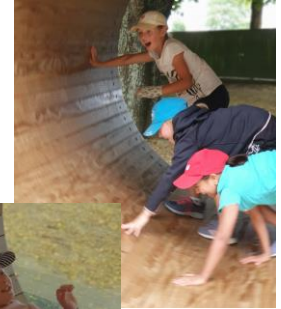
FUN ON CAMP